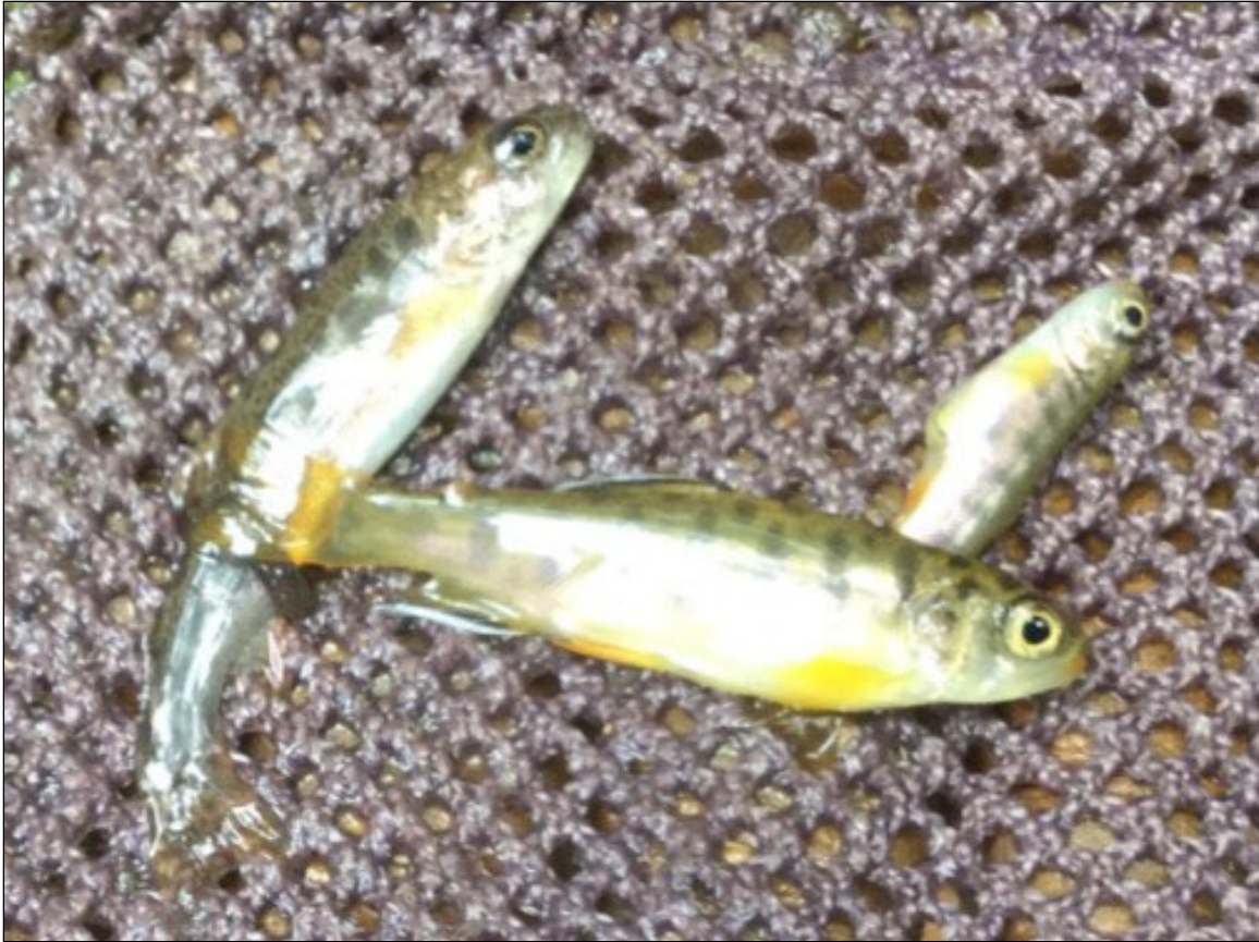
Figure 1.—Juvenile coho salmon and Dolly Varden captured at waypoint 1096.